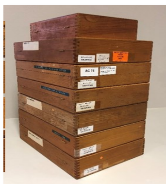
'Historical Loan' Returns Home

Due to the early colonisation and geographical situation on the trade routes around the Cape, South Africa has suffered invasions of weeds since the 1600s, with many hundreds of invasive weeds now well established and causing serious environmental and agricultural problems. Biological control as a management tool against weeds of agricultural significance was first initiated in South Africa in 1913, but then became more focussed on weeds of environmental importance in the 1960s against the Australian invasive trees that threatened the biodiversity in the unique fynbos biome of the Western Cape Province. As such, South Africa was the first country in Africa to become involved in weed biological control and South African scientists are now recognized among world leaders in this field. The ARC-PHP has been involved in weed biocontrol since the 1970s, with the research capacity ramping up during the last 20 years. The success of weed biocontrol in South Africa is mainly due to the long-term sustained financial support provided by the Natural Resource Management Programmes of the Department of Forestry, Fisheries and the Environment (DFFE: NRMP) which has