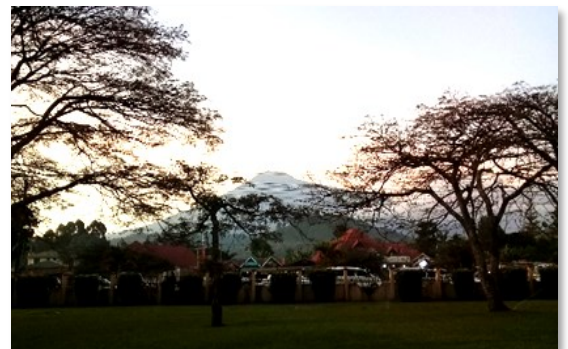
Mount Meru, Arusha, Tanzania