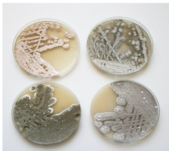
Pure cultures of four Streptomyces species isolated from the root zone. DR WJ BOTHA

Some species promote root growth and protection against pathogens. Streptomyces species are the most plentiful and important actinobacteria, and comprise between 10% and 50% of soil microflora communities. Most are free-living and occur in both natural and agricultural environments, where they colonise plants' root zones and different morphological parts of the roots. They produce numerous bioactive compounds, such as antibiotics, phytohormones and cell wall-degrading enzymes. They can function as biocontrol agents or antagonists of soilborne pathogens and have plant growth-