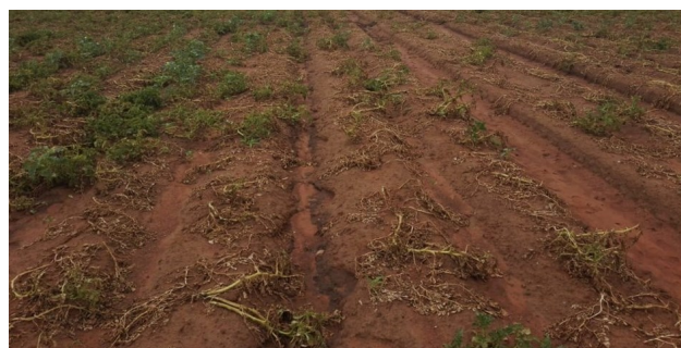
Potato early dying in the field

Verticillium dahliae consistently caused symptoms of PED under glasshouse conditions and is therefore considered the primary pathogen of potato early dying. During the first season, of the plants from which V. dahliae was isolated, 91% was in combination with C. coccodes and 23% in combination with Pectobacterium spp. During the second season, 71% was in combination with C. coccodes and 38% in combination with Pectobacterium spp. Considering the number of isolates found of C. coccodes and Pectobacterium spp., their pathogenicity and virulence, the co-isolation percentage with V. dahliae , and the symptoms observed on the potato plants from which these pathogens were isolated, it can be concluded that these two pathogens, and especially C. coccodes play a prominent role in PED in the Limpopo Province.