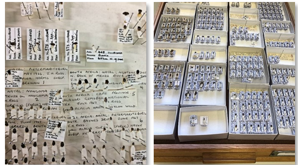
Contents of a drawer before (left) and after (right) curation has been conducted

Contact: Elizabeth Grobbelaar at GrobbelaarB@arc.agric.za