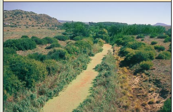
Waterway infested with red water fern