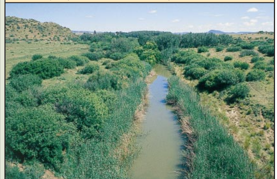
The same waterway after the introduction of the weevils