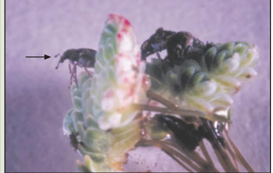
Adult frond feeding weevils

As the population of weevils increases on a weed mat, damage becomes evident. The mat will break up and most of the plants will then sink and rot. Severely infested sites are usually cleared in less than one year.