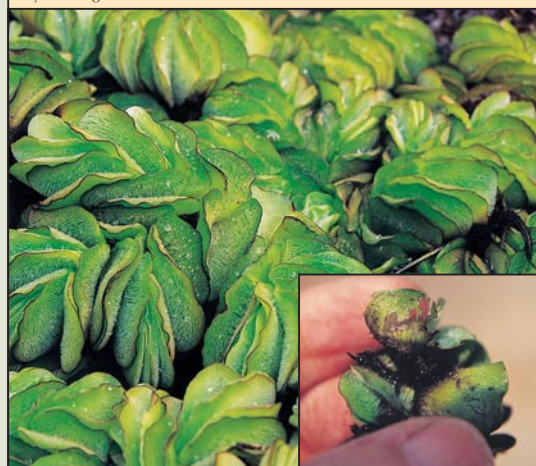
Salvinia molesta . Inset shows weevil damage.