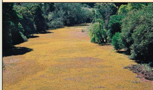
Salvinia BEFORE bio-control