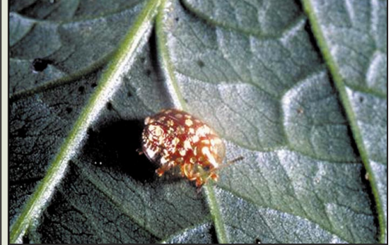
Adult tortoise beetle

By causing leaf drop and die back of new shoots, high beetle populations can reduce the density of the weed and its mats, allowing other desirable plants to outcompete and displace the weed.