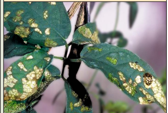
Adult and larval damage on leaves