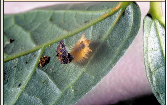
Tortoise beetle larva