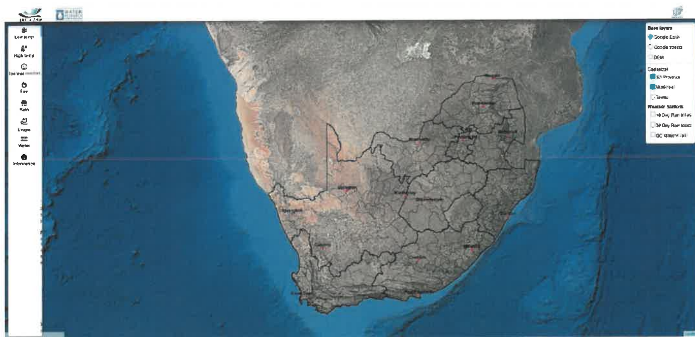
Figure 1: Homepage of the Weather Risk app showing the national coverage and the interactive web-based interface.

Weather and water availability information is most useful when it can support practical decisions on the ground. Observed indices on the Weather Risk app help users understand