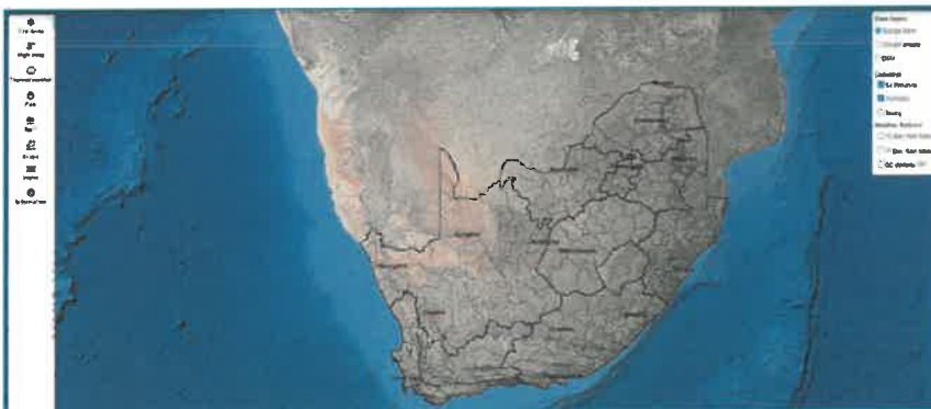
Figure 1: Homepage of the Weather Risk app showing the national coverage and interactive web-based interface.

It combines observed weather and water-related data with short-term forecasts, enabling users to assess current conditions as well as potential upcoming risks. Designed with practical decision-making in mind, the app supports farmers, extension officers, agricultural advisors, and others who require accessible and reliable information for planning and risk management. Although designed with simplicity in mind, guidance on navigating and using the app is available through an online user guide that can be downloaded at www.github.com/climindex/hydroclimsa/blob/main/App_user_guide/Weather_Risk_app_user_guide.md#weather-risk-app-user-guide .