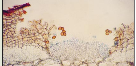
Section through gall showing young teliospores

Rust fungi do not kill the cells of their host as the fungus actually stimulates plant growth. Rather, it predisposes the tree to succumb to other stress factors that kill the plants within a few years. For example, severely affected plants appear to be more susceptible to drought stress. Heavily infected plants bearing several hundred galls and "witches' brooms" produce fewer phyllodes (leaf-like stems), flowers and pods. Branches, weakened by galls, often break. After the decline of Port Jackson, native plant regeneration varies from site to site. Fynbos generally recovers rapidly in recently invaded areas but more slowly in areas affected by older infestations of Port Jackson.