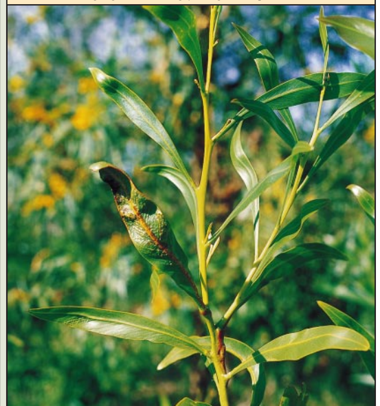
Young infection of Port Jackson leaves by the gall rust fungus