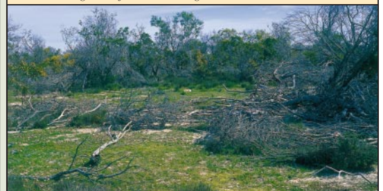
Port Jackson trees killed by the gall rust fungus