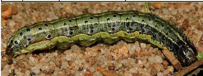
Seboko sa FAW (Sefala sa bohloano sa tšwetšopele)