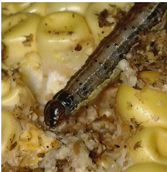
Tshenyi ya FAW go lefela

Balemi ba swanela go ela hloko gore bagase fela dikhemikhale tšeo didumeletšweng ke mmušo go bolaya dikhunkhwane. Gape, go šomišwe tekano ya maleba go ya ka tselo yeo e bontšhago ke lebotlolo la khemikhale. Khemikhale e swanetše e gašwe fela go maloko a manyane a dibokwana ao a lego ka fase ga dimilimitara tše lesome (10mm). Kgašo ya khemikhale go lwantšhana le dibokwana tše kgolo ga e atlege gobane, tšona diiphepha ka gare ga matlakala ao a kopakopanego. Se ke sona seo se dirago gore khemikhale ese ke ya fihelela dibokwana tše ka nako ya ge e gašwa.