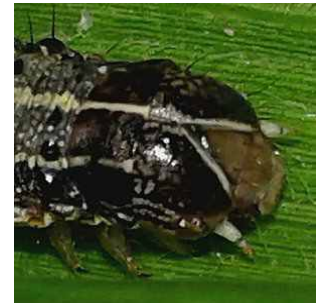
Hlogo ya FAW yeo o bonagalago "Y" ye e lebeleletšego fase ebile e na le bošweu