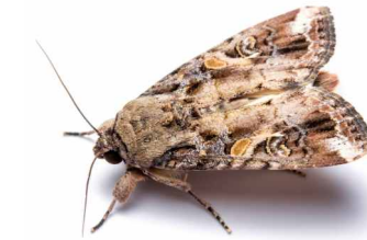
Serubele se setona sa FAW