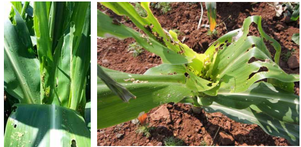
Tshenyi ya FAW go matlakala a sebjalo sa mafela