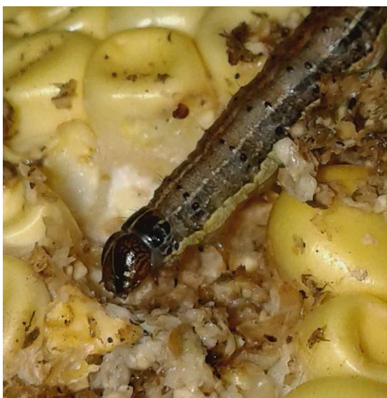
FAW damage to sweetcorn ear

Please report all observations/outbreaks of the FAW to