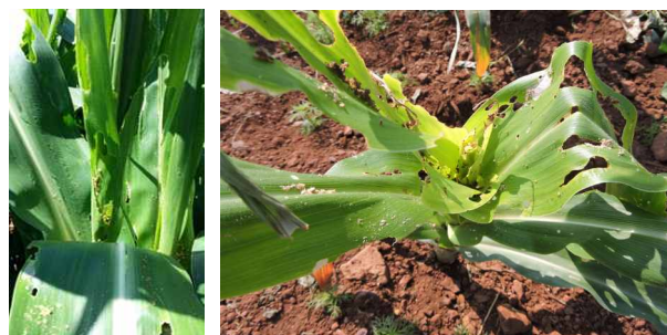
FAW damage to maize leaves