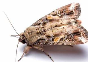
FAW Adult male moth