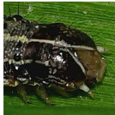
FAW head showing inverted white "Y"