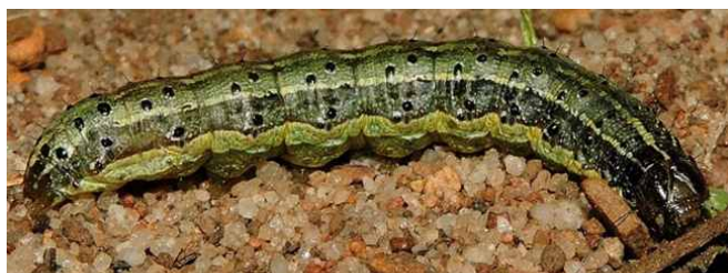
FAW larva (5th instar)

Please Note: Due to the cryptic pattern variations seen in the samples received in South Africa, the identification is sometimes confused with other noctuid moth species. Samples can be sent to Ms Vivienne Uys at ARC-PPRI, for a reliable morphological identification.